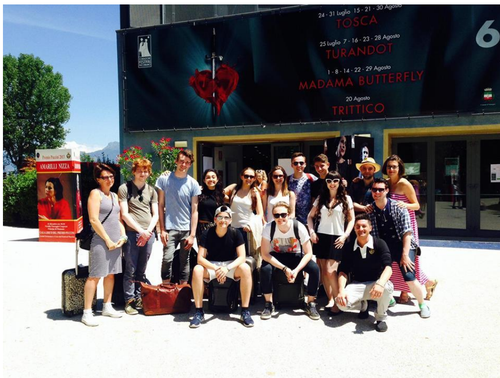
In front of Fondazione Festival Pucciniano, the group Stage2 from Birmingham poses with the organizers of Teatro Rumore, before leaving, in June 2015