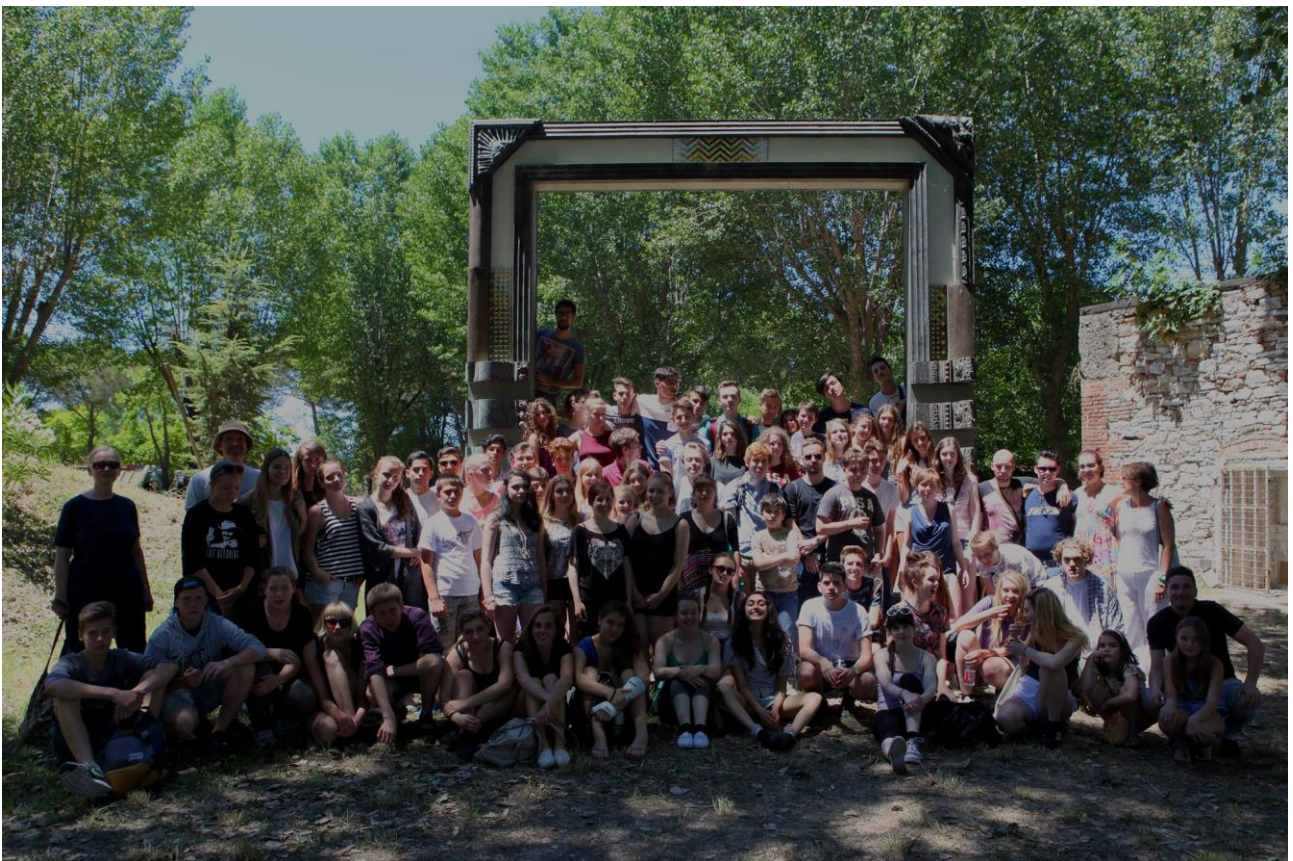
Up: a frame of the mini-documentary about our festival in 2016. Below: a part of the participants at the first edition in 2015