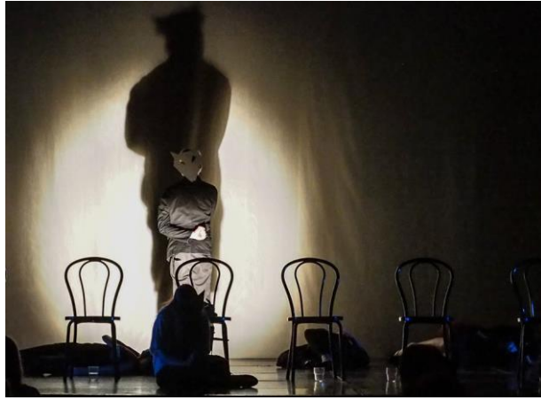
"Herd Animals" by TaO! from Graz, Austria, Auditorium Caruso, 2016