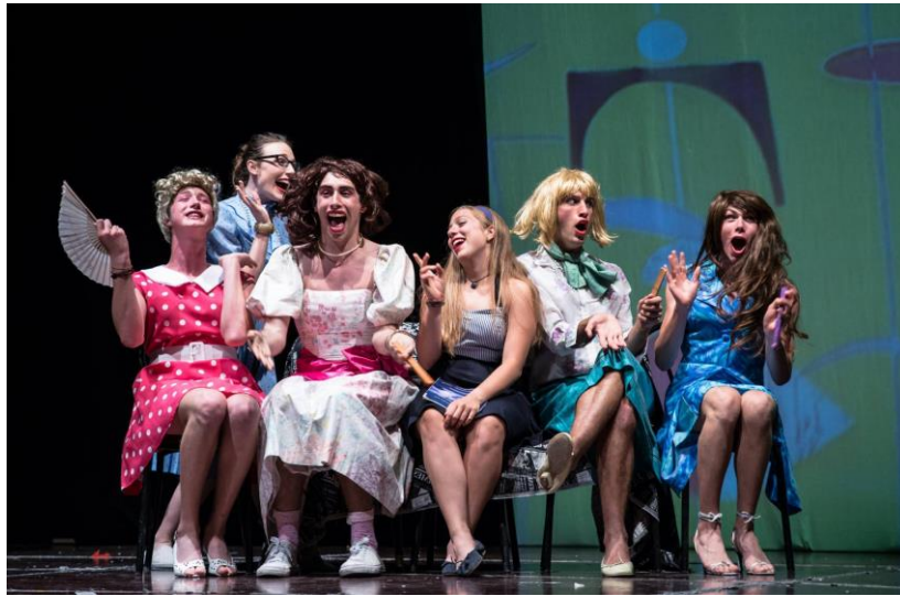
"BoomErlang", by Teatro Rumore, Auditorium Caruso, 2016