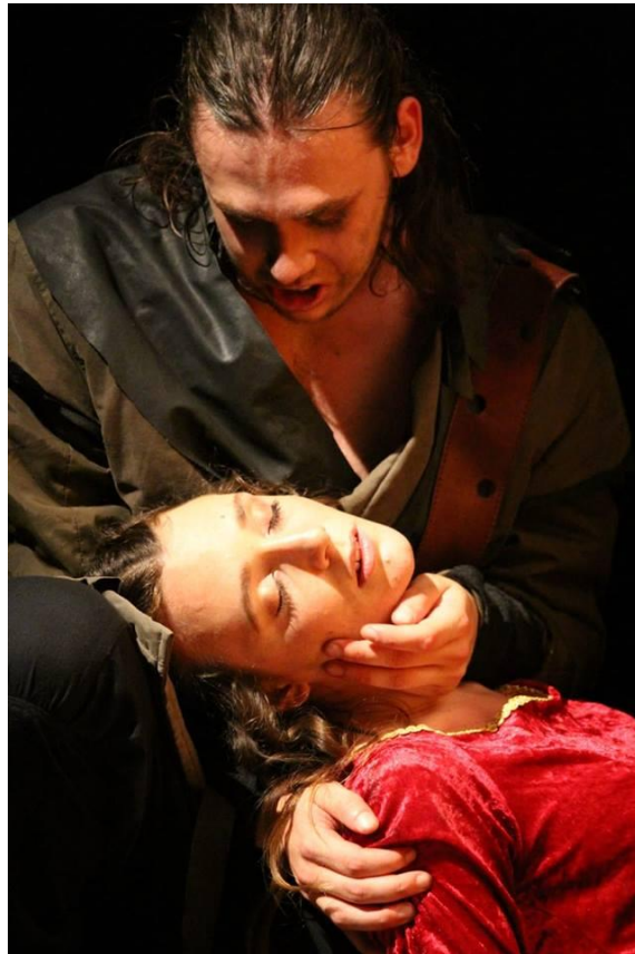
“Macbeth. Piena di scorpioni è la mente” by Teatro Rumore, Auditorium Caruso 2018