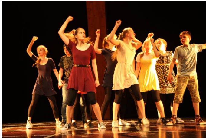
"Lost" by Little Academy, Vilnius, Lithuania, Auditorium Caruso, 2015