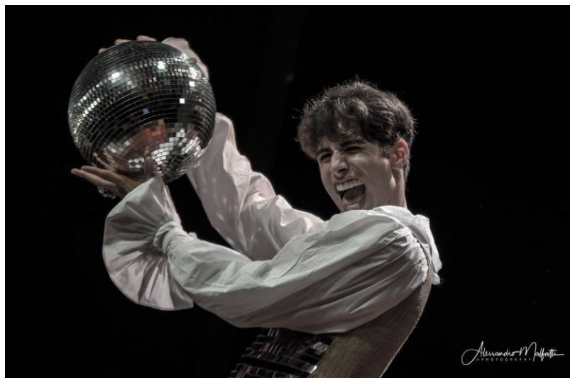
“Amleto. Non abbattemi”, by Teatro Rumore, Auditorium Caruso, 2018