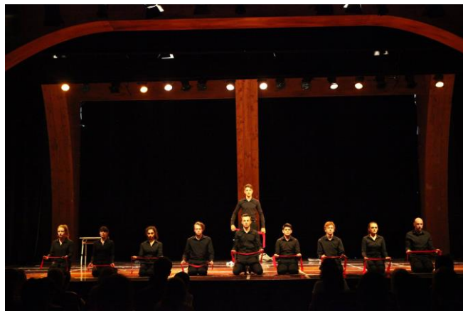
"Requiem for Ground Zero ", by Stage2, Birmingham, UK , Auditorium Caruso, 2015