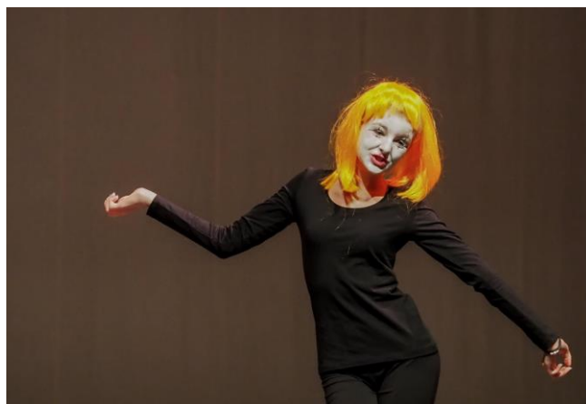
"Your words in our mouth" by Platform, from Glasgow, Scotland , Auditorium Caruso, 2016