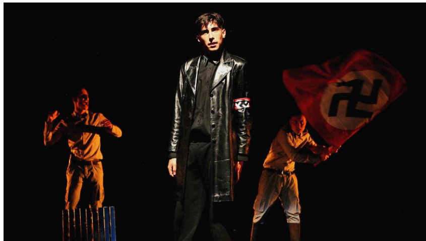
"70 + 1 Nella mano la memoria", by Teatro Rumore, Auditorium Caruso, 2015

Below and in the next pages: workshops during our Festival, in 2015