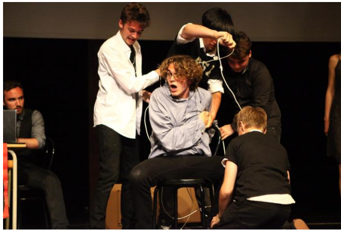
"Hacktivists" by AKT from Brighton, UK, Auditorium Caruso, 2015