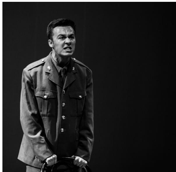
"The virtue of Sin" by Stage2, Birmingham (UK), Auditorium Caruso, 2016