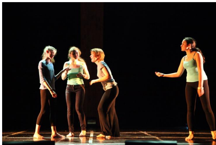
"Solo, Variations on Being Alone " , by UBI Youth, Leipzig, Germany , Auditorium Caruso, 2015