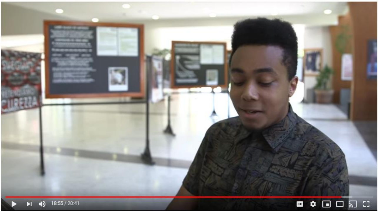
Rumori in Scena